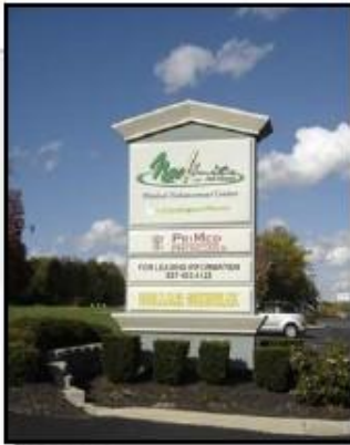
Monument sign along SR 48